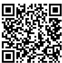
Watch Part 2